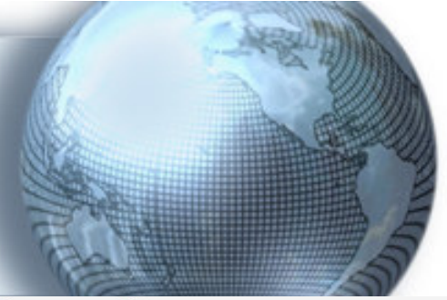
Proses Pertukaran Mahasiswa Asing ke UI (Inbound)